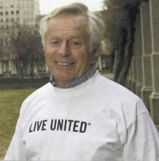
Photographed at Procter & Gamble Plaza